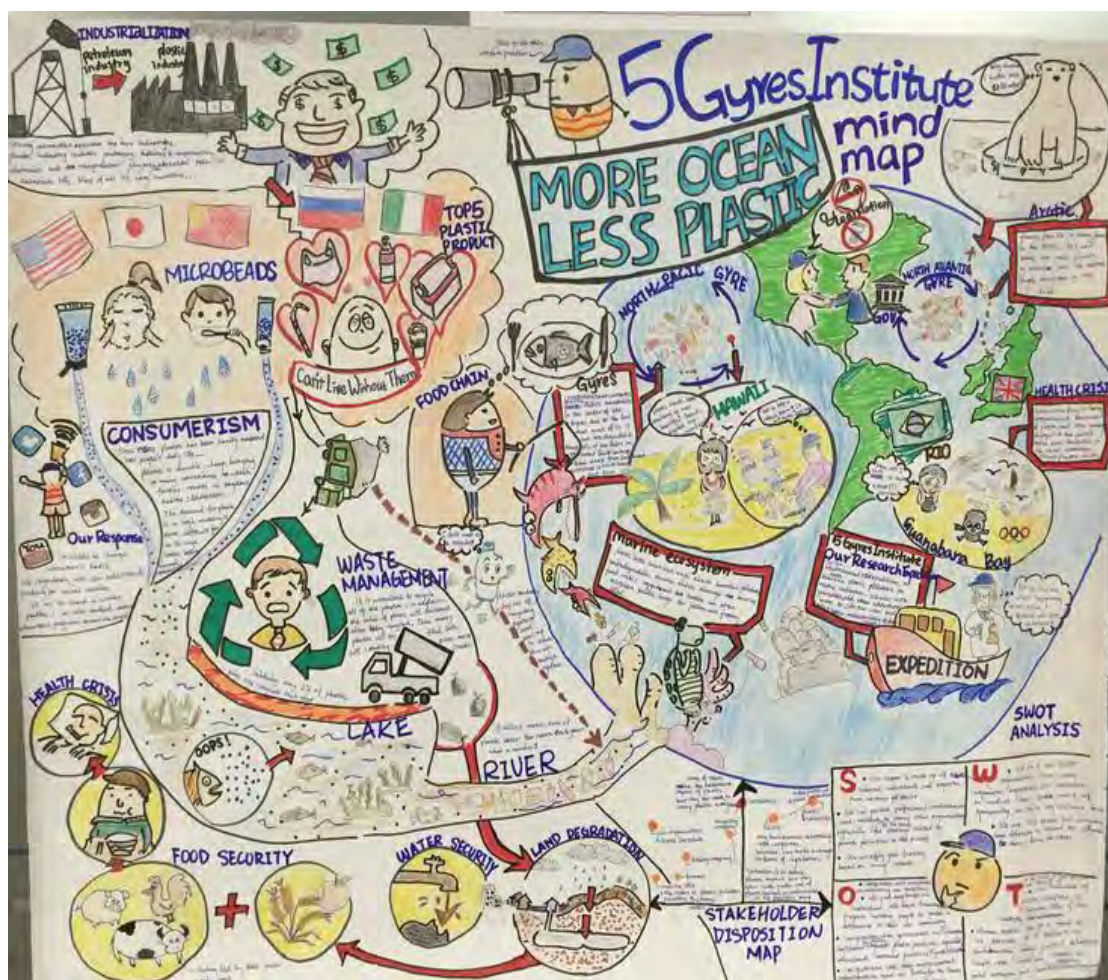
Figure 4: Mind Map Poster illustrating the response of the 5 Gyres Institute Stakeholder to the plastic pollution ‘wicked problem’ raised in The Plastic Age? Role Play in September 2016. Student permission has been given for using these materials.

The poster in Figure 4 was submitted by the stakeholder group representing 5 Gyres Institute (www.5gyres.org) in response to plastic pollution in The Plastic Age? Role Play in September 2016. It represents visually the team’s analysis and response to ocean plasticization through their stakeholder lenses (environmental, scientific) and in consideration of other stakeholders in play.