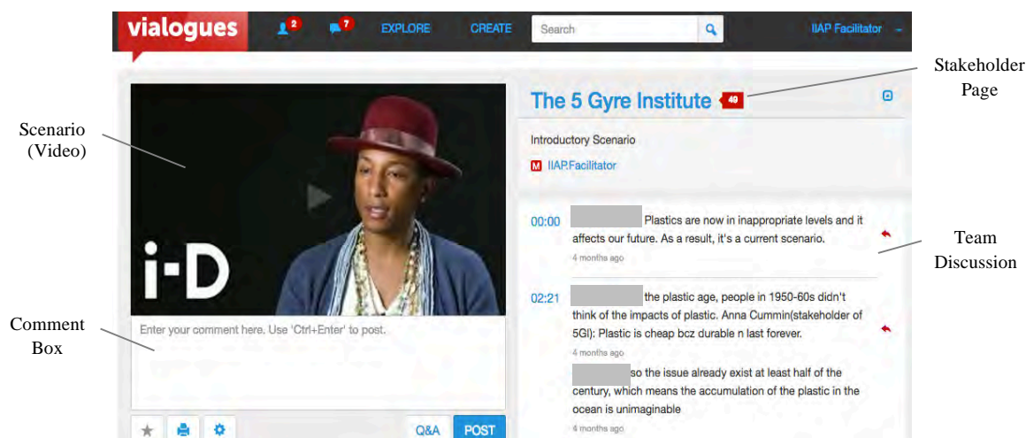
Figure 3: A snapshot of an online discussion about the Introductory Scenario 2016 Role Play Assessment WIKI: The Plastic Age? For privacy reasons, the names of the learners participating in this discussion have been covered.